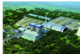
Biomass power generation