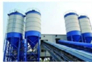
Asphalt Stir Plant